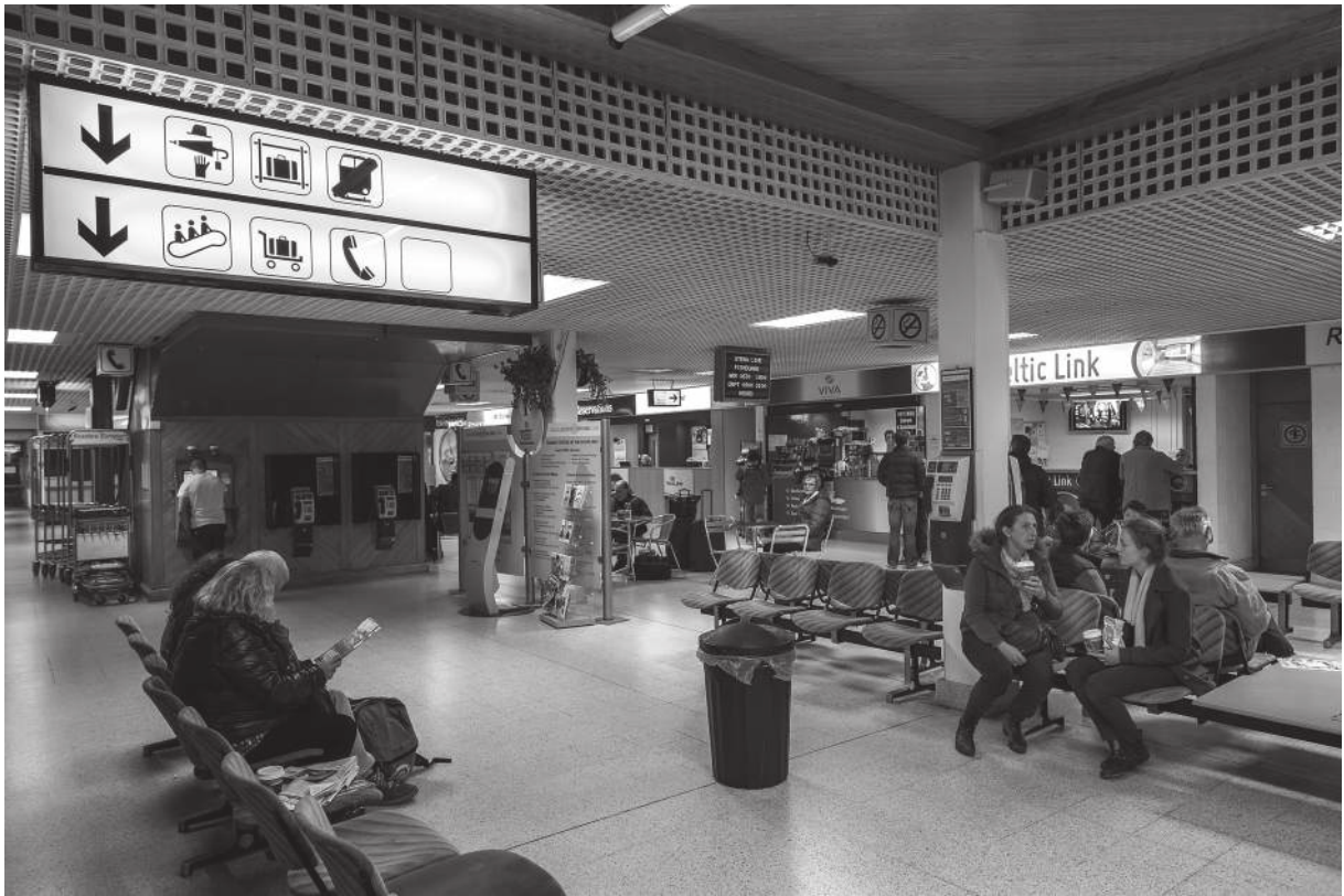
Waiting area at a ferry terminal, Rosslare, Ireland.